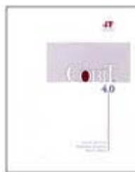
CobIT 4.0 in print form

The IT Governance Institute is about to launch its first update in five years to a technology management standard with a greater focus on business regulations and compliance issues.